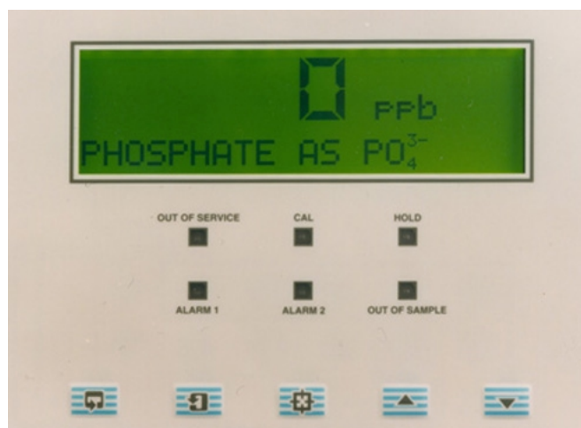
Display and Key Pad