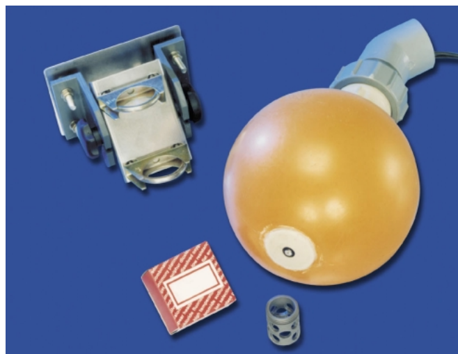
9408 Floating Ball Kit – Swivel-bracket not included

Instruments All 9408 systems are compatible with the 4640 and 4645 dissolved oxygen transmitters. (See Data sheet SS/4640)