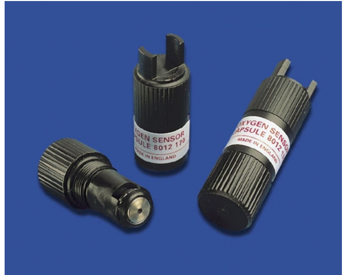
Model 8012/170 Oxygen Sensors

The heart of the system and the key to success is the dissolved oxygen sensor. Easy to maintain with no specialist skills required when replacing capsules, keeping cost of ownership to a minimum.