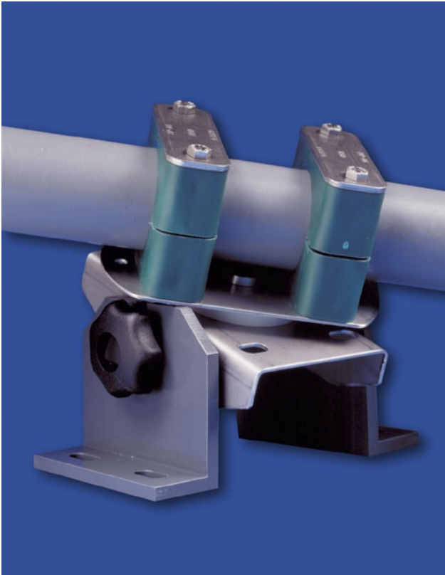
Swivel-bracket – Optional Extra

To make routine maintenance even easier and more convenient, there is an option to order the floating ball system with a swivel bracket. This enables the system to be rotated horizontally for cleaning purposes without the need to remove it completely.