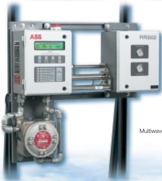
Multiwave™ Process Photometer

On a multichannel photometer, a reference wavelength is chosen where the stream components have little or no absorbance. The measure wavelength or wavelengths are chosen where the measured components have absorbance. The micro-processor will then use matrix algebra and apply the proper response factor to each filter to eliminate interferences on the desired component and convert the absorbance to a component concentration.