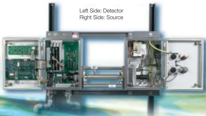
ABB Process Photometers provide reliable performance in the Petrochemical, Chemical, Refining, Gas Processing and Product Pipeline industries.