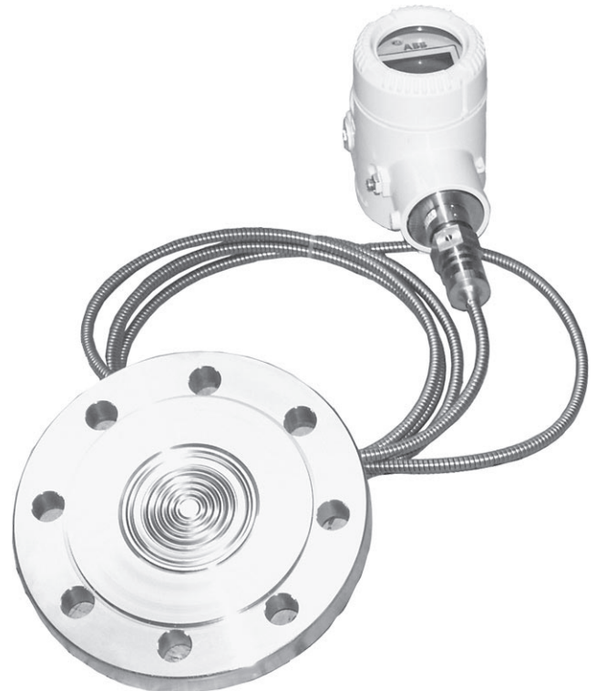
ABB 2600T Series Engineered solutions for all applications