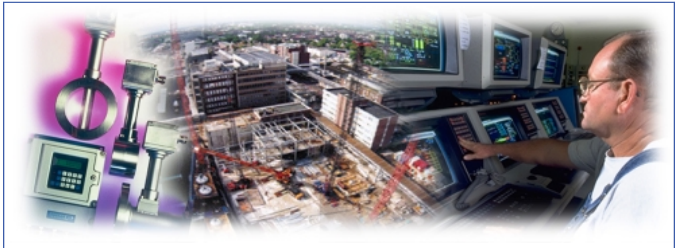
ABB installed at BASF's site the biggest PROFIBUS system ever used in the field of process engineering throughout the world. This challenging automation project does not only imply the use of modern PROFIBUS technology, but is also the first practical realization of the new concept for integral engineering of field instruments...using the Field Device Tool (FDT).

Client: BASF Location: Ludwigshafen, Germany Scope of Work: PROFIBUS Installation