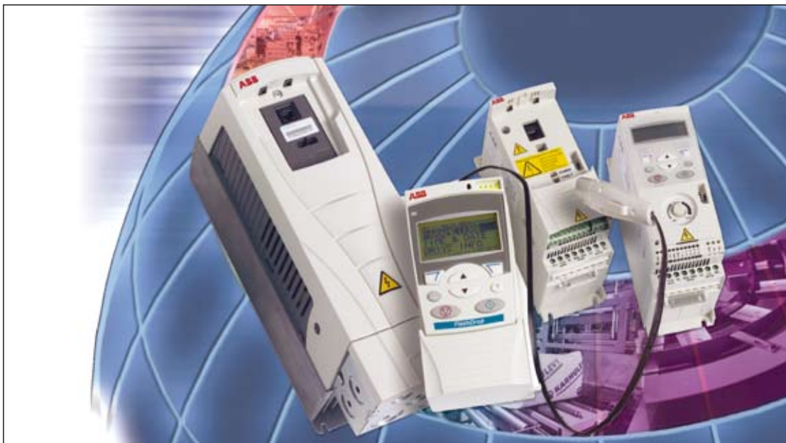
FlashDrop is a tool for volume customization of ABB drives

FlashDrop is a powerful palm sized tool for fast and easy parameter selection and setting. The tool can copy parameters between two identical drives, or between a PC and a drive, making it suitable for volume customization as well as fast and easy commissioning.