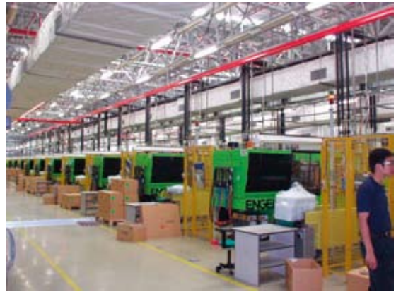
Overhead air conditioning ductwork in a factory.