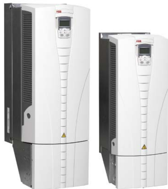
ABB ensures that its products are updated in line with the latest official standards and requirements. The enhanced standard drives comply with the EU's RoHS 2002/95/CE Directive restricting the use of certain hazardous substances. They have also been issued with a declaration of conformity which confirms that they have been tested in combination with certain ABB motors for use in DIP (Dust Ignition Protection) environments.

The 55 kW drive is being reduced from frame size R6 to R5 for an approximate 50% decrease in both weight and volume.