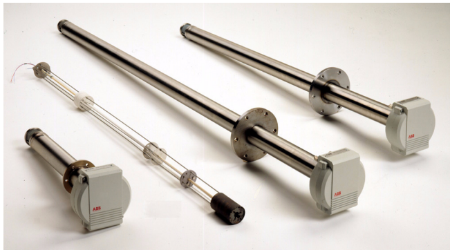
The ZFG Range of Probes

The ZFG2 Flue Gas Oxygen Probe is the most advanced in the world. A simplified design makes all the component parts easily accessible and field-serviceable. The new universal probe construction gives the ultimate system flexibility while retaining all the features, benefits and reliability of the previous generation.