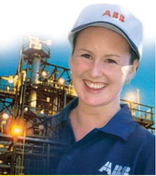
ABB is your partner: From consulting to project planning, from system installation to after-sales service.

Naturally, after any purchase after-sales services are just as important to you, as they are to us. That's why we offer you a broad spectrum of specialized services, such as: continuous maintenance, analyzer system modifications and troubleshooting etc. We'll be pleased to put together an individual service package for you.