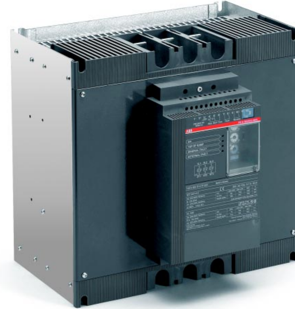
ABB Building Technologies