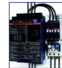
A typical 'Inside Delta' combination as a replacement for a Y/D-starter

The total solid state solution, e.g. no moving contacts in the main circuit, is an attractive solution for applications with many starts per hour. The clear marking on the front makes the installation and settings very easy. The adjustable parameters ramp time for start, ramp time for stop and initial voltage make it possible to adjust the softstarter for nearly all applications.