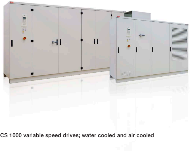
ACS 1000 variable speed drives; water cooled and air cooled

ABB offers an auxiliary power upgrade for its ACS 1000 medium voltage drive to further increase the drive's reliability and availability.