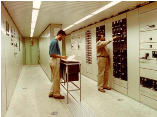
Inside a container with electrical equipment