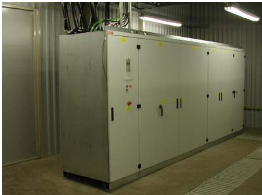
Containerized variable speed drives