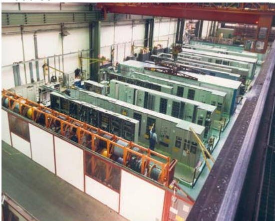
Pre-testing electrical and control equipment in the factory

ABB supports fast track power plant projects by integrating major parts of the electrical and automation equipment in module containers. The equipment will be pre-assembled and pre-tested and thus after delivery of the modules to site, commissioning time can be significantly reduced while insuring high quality. ABB being a single-source supplier, provides all engineering, assembly, installation and commissioning services for the supply of the modules.