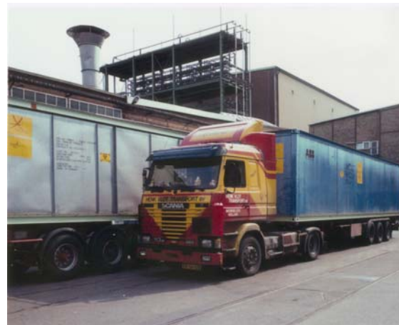
Fast shipping of pre-tested containerized electrical and control solutions

The containers are delivered separately to site where they are integrated into an electrical and control building module.