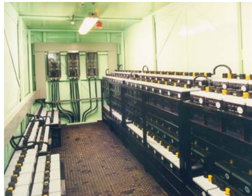
Containerized batteries for 24 Volt and 220V uninterruptible power supply

To ensure a continuous supply of power to essential loads in the event of a power systems fault or the failure of the auxiliary supplies, 220V and 24 V station batteries equipped with chargers, inverters and the associated switchgear are provided.