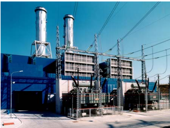
Combined cycle power plant with step up transformers

The step-up transformer transmits the generator's electrical energy to the HV power system and supplies the unit auxiliary transformer with energy from the power system when the generator breaker is open. On-load tap changers are provided for adjustment of the HV and the reactive power.