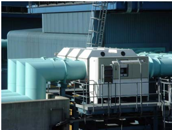
Generator bus duct with generator circuit breaker