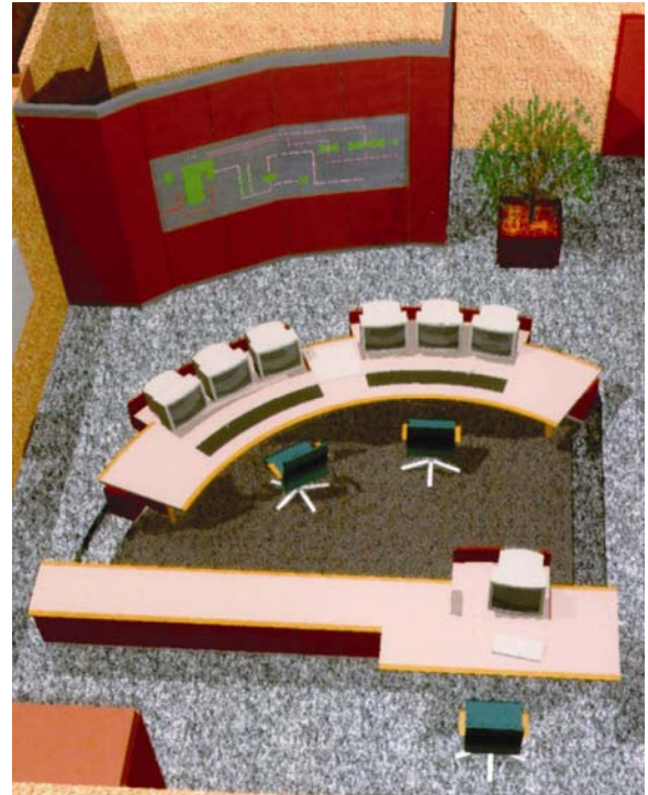
Containerized control room of a combined cycle power plant

The application software is built using standard software module libraries. This reduces the possibility of errors and increases the overall reliability and availability of the system.