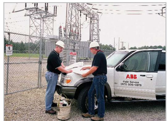
ABB field service technicians are factory-trained and equipped to support power plant, substation or industrial installations

The MV Service factory-trained technicians offer comprehensive field maintenance and repair services for planned and emergency work, 24 hours a day, 365 days a year. Service personnel have direct contact with the MV Service factory for authentic parts, original equipment drawings and technical support. Services include switchgear and circuit breaker commissioning, inspection, testing and refurbishment; replacement of breakers, relays and control components; primary bus upgrades and related switchgear services. ABB also offers maintenance and repair training, from product orientation for new equipment, to advanced repairs and life extension.