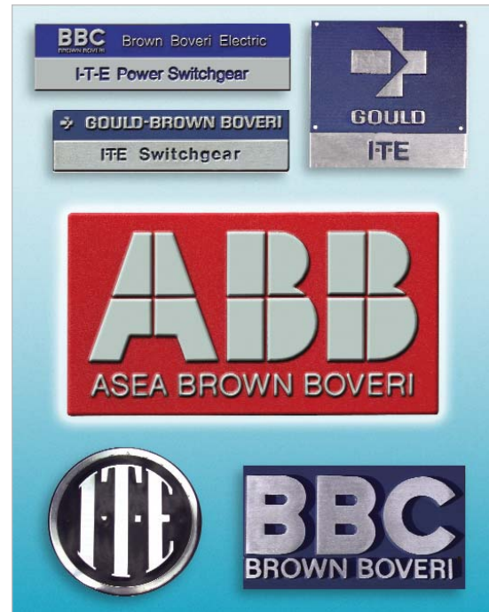
MV Service supplies replacement components for the full line of ABB switchgear products

ABB Medium Voltage Service (MV Service) understands the importance of meeting customer needs. When it comes to extending switchgear life and reducing maintenance costs, no one can afford to take risks. Downtime is expensive, and access to new, high quality authentic replacement components is essential. ABB is here to meet those needs.