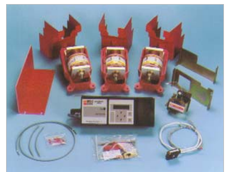
MPSC-2000 trip unit retrofit kit

New K-Line® circuit breakers are equipped with state-of-the-art MPSC-2000 microprocessor trip devices. Optional type OD and SS units are available on replacement K-Line® breakers. The MPSC-2000 is available as a retrofit kit to upgrade K-Line® breakers originally equipped with OD, SS, MPS or MPS-C trip devices. MPSC-2000 uses a digital RMS trip system and provides maximum functionality and selectivity for a variety of applications, in addition to communications capabilities. The retrofit kit includes the MPSC-2000 trip device, magnetic latch, lower base molding with sensors, wiring harness and instructions.