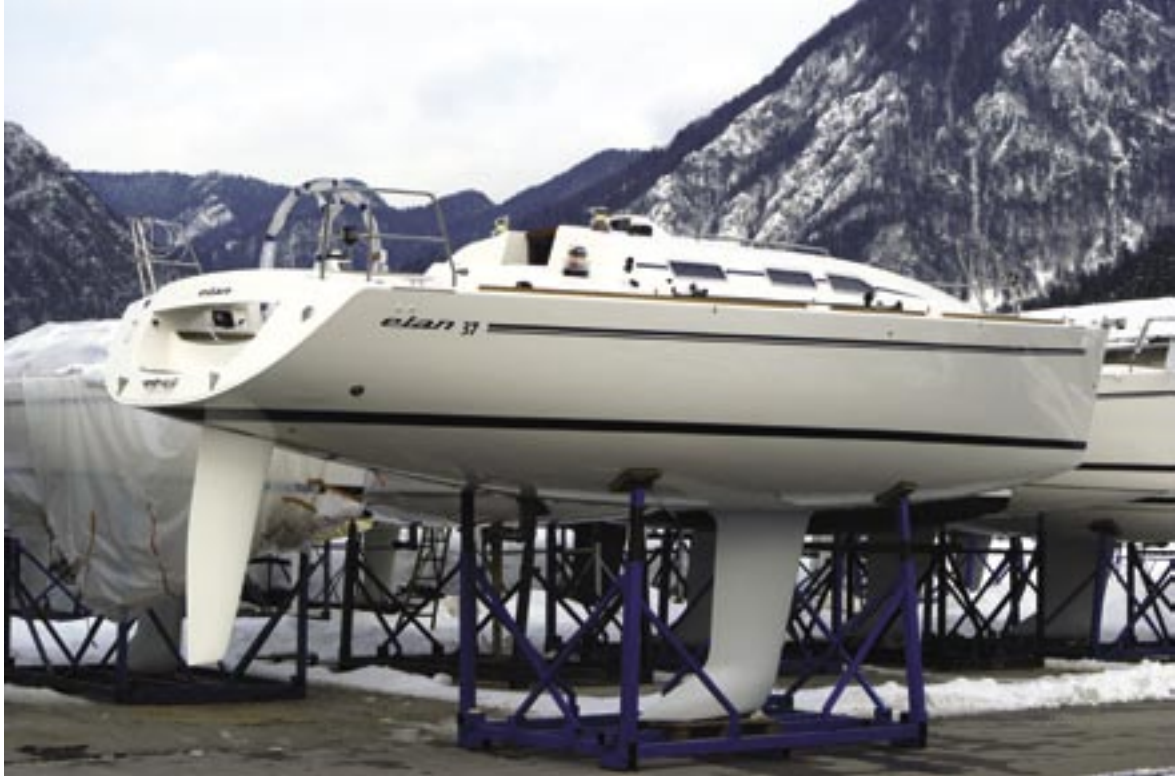
Elan produces sailing boats from 31 feet to 45 feet long. These are quality performance cruisers with high safety.

Elan has been producing boats since 1949. In 1962 Elan started to produce boats from reinforced polyester. At present they make approximately 350 sailing- and power boats annually.