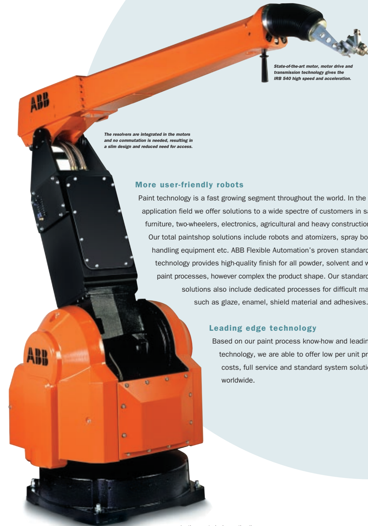
State-of-the-art motor, motor drive and transmission technology gives the IRB 540 high speed and acceleration.

Our standardised and dedicated solutions draw on thirty years of paint process know-how and experience to address your requirements for lower costs, higher finish quality and reduced emissions.